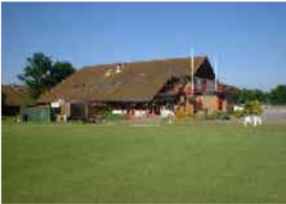
Bournemouth Sports Club