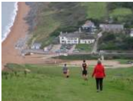
Waiting on Doghouse Hill for the banner to arrive from Golden Cap.