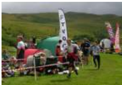
Nicola Brooke storming into the finish