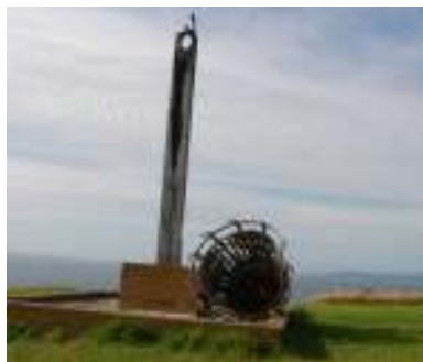
Aberystwyth beacon, which caught fire during the celebrations for the Queen's Jubilee in 2000.