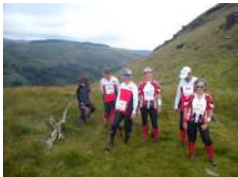
Waiting to start.....