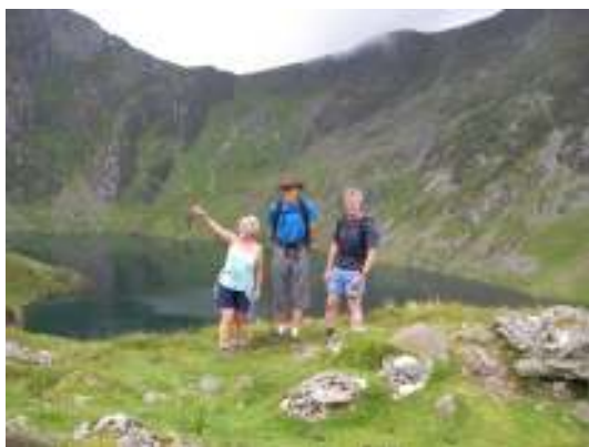
“Rest” day (!) on Cadair Idris