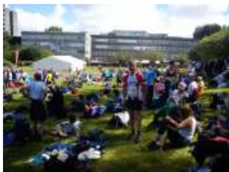
Last day at the University