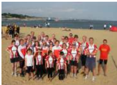
TEAM WESSEX —WELL DONE TO EVERYONE!!

Sure enough Kerno finished with a cumulative time just 2min 37 sec in front of us, which was the closest finish since 2000. So our record breaking run of five successive victories finally came to the end, but I