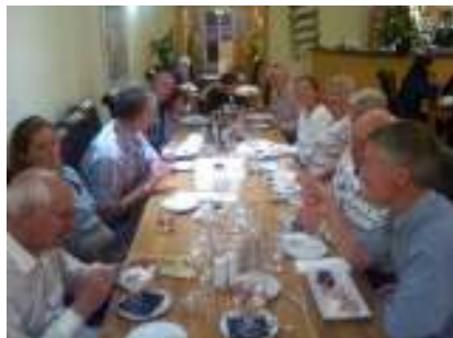
Wessex celebration meal